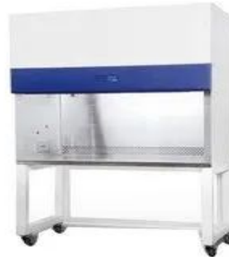
Horizontal Laminar Air Flow Cabinet