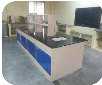
Laboratory Work Table