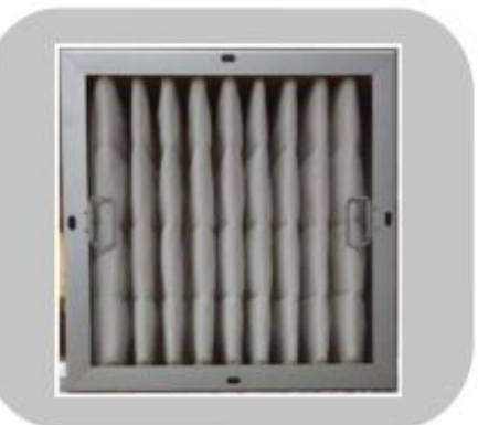
Pre / Fine Filters