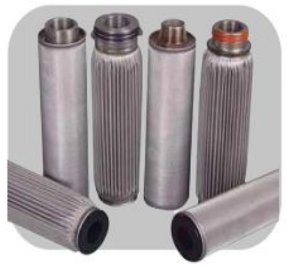
Filter Cartridges & Filter Bags