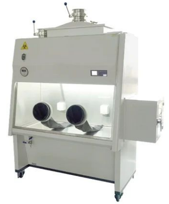
Bio Safety Cabinets (Class I, II & Class III)