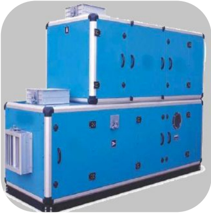
Air Handling Unit (AHU)