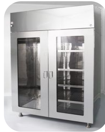
Sterile Garment Storage Cabinet