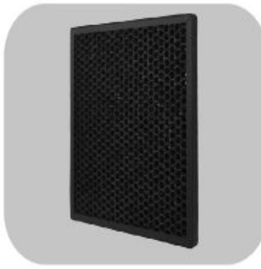
Activated Charcoal Filters