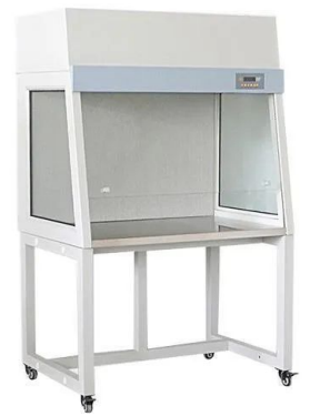
Vertical Laminar Air Flow Cabinet