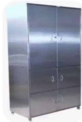
Apron Storage Cabinet