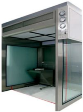
Reverse Laminar Air Flow Cabinet